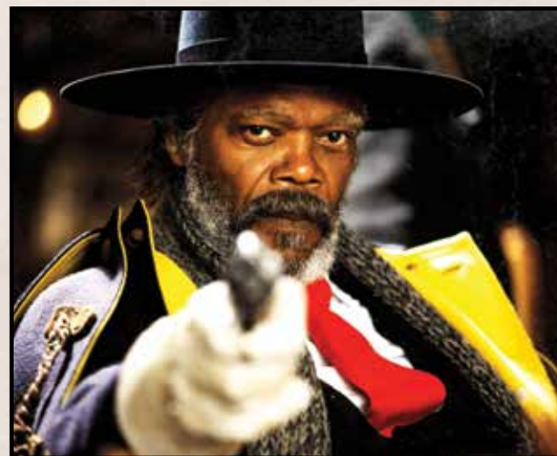
SAMUEL L. JACKSON IS MAJOR MARQUIS WARREN AKA "THE BOUNTY HUNTER"

"Bringing guilty men in alive is a good way to get yourself dead."