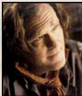
MICHAEL MADSEN IS JOE GAGE AKA "THE COW PUNCHER"

"Justice delivered WITHOUT dispassion is always in danger of not being justice."