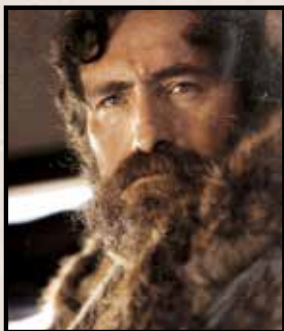
DEMIAN BICHIR IS BOB AKA "THE MEXICAN"

"What my daddy fought for was dignity in defeat and against the unconditional surrender."