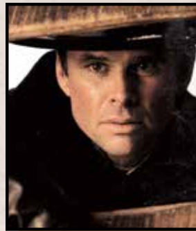
WALTON GOGGINS IS CHRIS MANNIX AKA "THE SHERIFF"

"You're gonna die on this mountain and I'm gonna laugh when you do!"