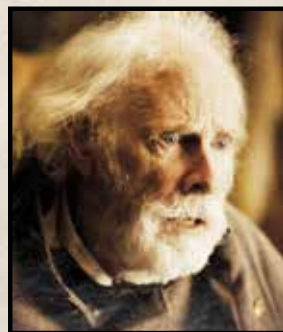
BRUCE DERN IS CONFEDERATE GENERAL SANDY SMITHERS AKA "THE CONFEDERATE"

"According to the Yankees, it's a free country."