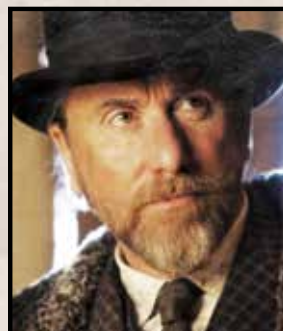
TIM ROTH IS OSWALDO MOBRAY AKA "THE LITTLE MAN"

"Justice delivered WITHOUT dispassion is always in danger of not being justice."