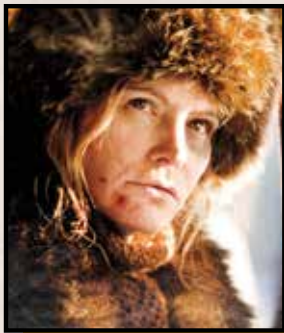
JENNIFER JASON LEIGH IS DAISY DOMERGUE AKA "THE PRISONER"

"You're gonna die on this mountain and I'm gonna laugh when you do!"